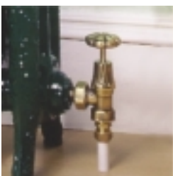
Brass Chartwell Valve (½" and ¾") connections