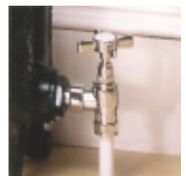
Chrome Belgravia Valve (½" only) connections